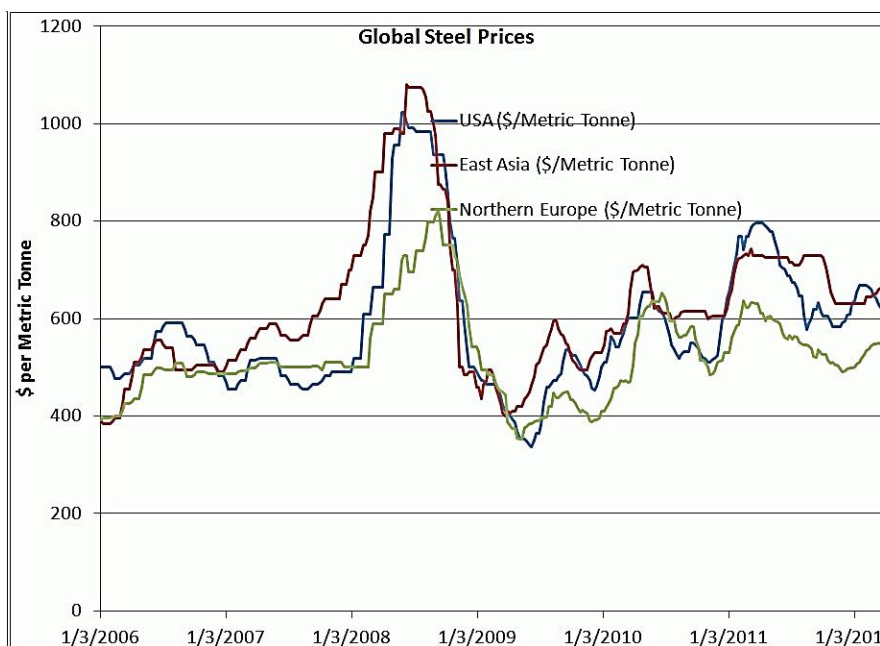
Figure 1. Steel prices evolution (Bloomberg, 2012)

In order to understand the steel market and how the company share price evolved, we look at the steel price evolution shown in Figure 1.