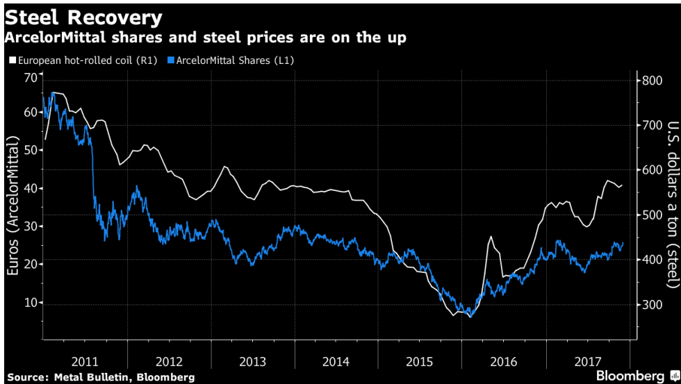
Figure 2. Company stock price history (Bloomberg, 2017)

Steel prices and producers' shares are being lifted as per the strong global demand. Nations have strengthened trade defenses after China's so-called steel dumping became a political flashpoint (Bloomberg, 2017).