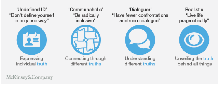
Figure 2. Generation Z characteristics (Francis & Hoefel, 2018)

A McKinsey & Company report highlights four fundamental Gen Z behaviors, all based on a single element– this generation continuous search for truth (Francis & Hoefel, 2018). These four behaviors, as seen in figure 2, refer to (1) individual expression highly valued by members of Gen Z; (2) Inclusivity and self-centeredness, as shown in another study (E&Y, 2015), that correlates with the findings of Francis & Hoefel (2018). This means that the younger people place a greater emphasis on their role in the world as part of a larger ecosystem and their responsibility to help improve it (E&Y, 2015), as they mobilize themselves for a variety of causes (Francis & Hoefel, 2018). (3) Finally, their decision-making process is highly analytical and pragmatic (Francis & Hoefel, 2018).