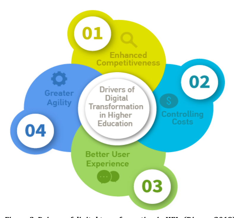
Figure 2. Drivers of digital transformation in HEIs (Digarc, 2018)

First of all, HEIs must become themselves digital organizations in order to provide digital teaching, digital learning, digital experiences, and finally, digital skills for their students. Becoming digital organizations requires digital endowments and specialized staff. It is important that the necessity of change is well understood, is approved and accordingly prepared by all parties involved. Organizational change, implemented in such large structures is likely to meet a certain resistance to change, which might be caused by a different type of factors. Passive factors refer to the individuals' habitude to their work style as well as a certain level of convenience with the daily work routine. On the other hand, there are active factors which include an offensive attitude towards new and alternatives methods or ways of developing tasks. "In this category, we also include the cultural inertia, which means the fear to act differently from the other members of the community" (Bejinaru & Baesu, 2013, p.128). At this point, HEIs should focus on understanding the main drivers of digitalization which are promising to lead to positive results and popularize them (Figure 2).