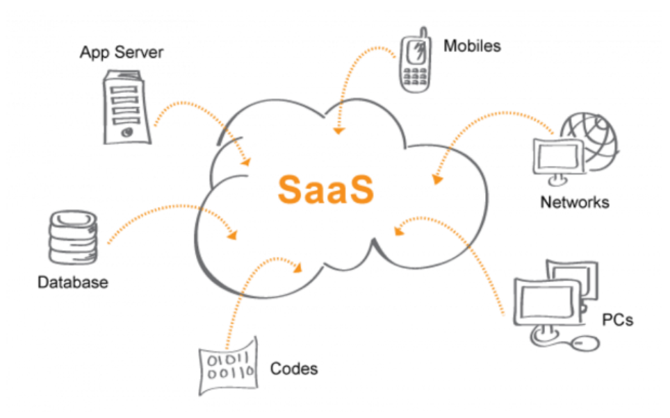
Figure 3. Examples of SaaS solutions (Digarc, 2018)

2. Control of costs: The financial management of the institutions must-have in the foreground the reduction of costs. Moreover, more attention is needed to justify tuition fees so that the cost/benefit ratio is a positive one for both students and the university. An alternative to reducing costs is one that saves on staff time and simultaneously reduces the volume of materials needed for file storage, which is called the spiral administrative method of controlling costs. The emergence on the market of SaaS solutions greatly facilitates the access of HEIs managers to acquire and implement them without spending their time and money with specialized teams or with the IT department. SaaS solutions (Figure 3) are easy to use and contribute to saving time and have a very high return on investment.