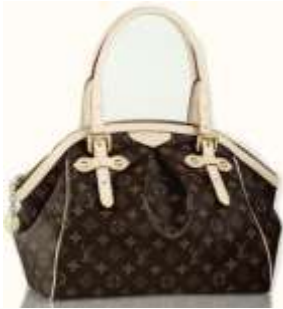
A loud product of the star brand