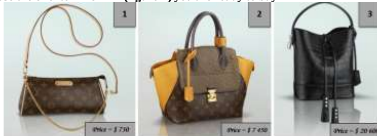
Figure 1 – LV items ( www.lv.com )

№ 3. Choose the one item from LV (figure 1) you are ready to buy: