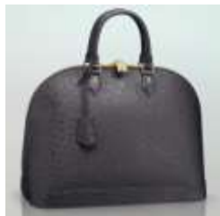
Alma GM, $ 10,900

As we mentioned before, the brand Louis Vuitton has both loud and quiet products, so both patricians and parvenus can satisfy their needs in different products of LV.