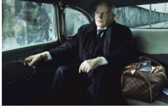
Picture 2. First and last Soviet President Michael Gorbachev in the advertisement for Louis Vuitton

When the USSR collapsed and Russia became open to the world, many luxury brands started to come to Moscow and Saint-Petersburg. Eventually from the end of the 20 th century the new non-Soviet Russia again has had strong admiration for luxury brands. Louis Vuitton boutique, which is a symbol of luxury brands' presence in the country, was opened in Moscow in 2003. Furthermore, a Soviet leader, Michael Gorbachev was a face of LV at the ad poster with the Berlin Wall in the background.