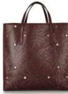
A quit product of the connoisseur brand