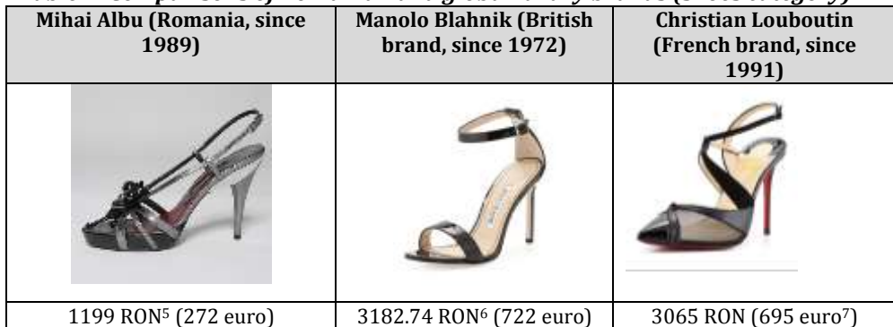
Table 2. Comparisons of Romanian and global luxury brands (shoes category)

During Soviet era, Romania has differentiated itself in shoes industry. There are some famous local shoes brands as Mihai Albu, Sepala, Musette. These brands still can't be compared with Labouten or Manolo Blahnik. The global luxury brands are priced much higher, so Romanian shoes have an advantage in price as it is reflected in the table 2. However, low price does not correlate with the exceptional image of luxury brands. Romanian shoes makers are oriented primarily to the local customers. Having said that Romanian Musette managed to push the national boundaries and increase the brand awareness and its presence in the world 4 . However, it is still not compared with Labouten and Blahnik in a category of global awareness and presence, including online. Uncomparably much more people from all over the world have knowledge about Labouten and Blahnik than about Musette and Mihai Albu.