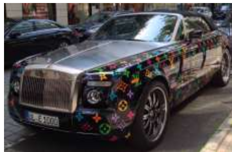
Picture 3. Rolls Royce decorated with LV monogram