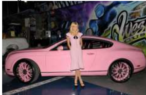
Picture 6. Paris Hilton with her pink Bentley

Parvenues want to demonstrate that they are wealthy. The brands which are consumed by parvenues should be easily recognized and their products must not be quiet. The pink Bentley (picture 6) could be appreciated among the people from this segment.