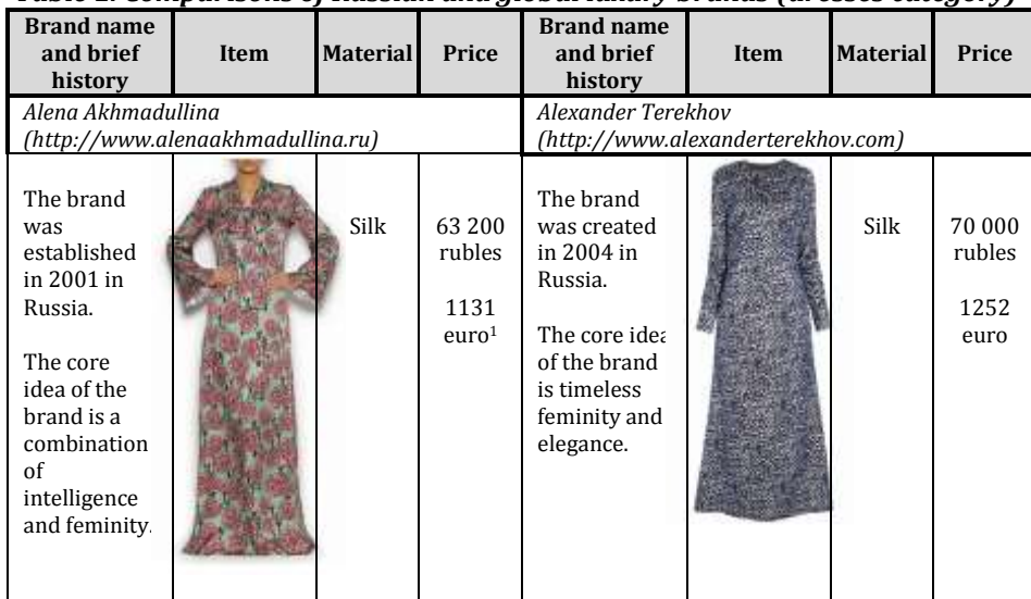
Table 1. Comparisons of Russian and global luxury brands (dresses category)