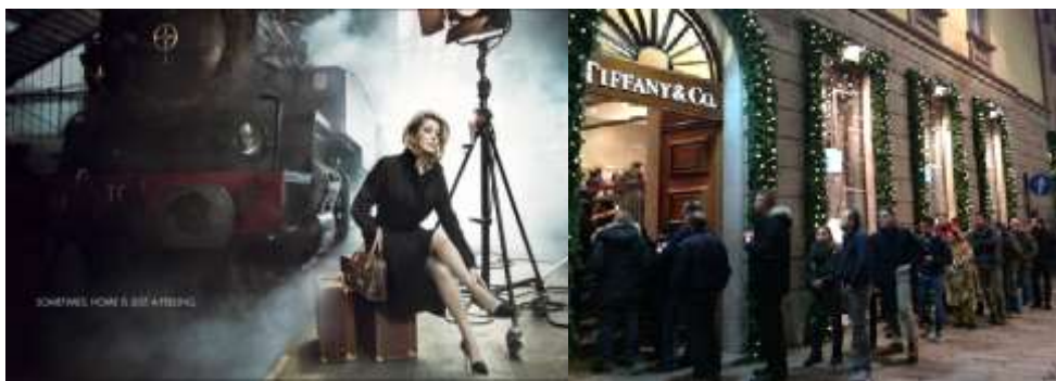
The ordinary of extraordinary people

Brands allow their consumers to express themselves (Young, Nunes & Dreze, 2010). Kapferer stressed that it is not obligatory to be extremely wealthy for buying luxury brands (Kapferer, 2013). He gave the example of the two groups of consumers who are not necessarily rich: the ordinary of extraordinary, and the extraordinary of ordinary people.