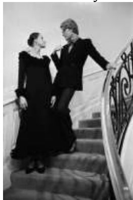
Picture 1. Russian ballerina Maya Plisetskaya and French designer Yves Saint Laurent

Nevertheless, in 1959 the French designer Yves Saint Laurent, being the head of the House of Christian Dior, came to Moscow with a fashion show. The USSR was under Nikita Khrushchev and it was an era of so called “Thaw”, when Soviet society became a “more liberal” in different spheres including fashion. The Christian Dior was chosen on different reasons. First, Dior style represented elegance and classics. Second, it was considered ideologically neutral (“Christian Dior in Moscow: a fleeting sense of happiness”, 2009). It is not surprising that Dior became one of the most famous French designers in the USSR. Although ordinary Soviet people had no access to luxury brands, a very few of them as outstanding and reliable actors and dancers, who were allowed to go abroad for festivals and tours, knew what luxury brands are. For example, a great Russian ballerina Maya Plisetskaya had costumes which were done for her by Pierre Cardin and Yves Saint Laurent (“Russian ballerina Maya Plisetskaya”).