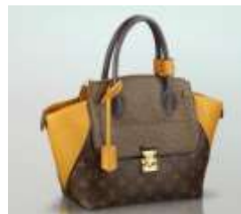
Majestueux Tote MM, $ 7,450