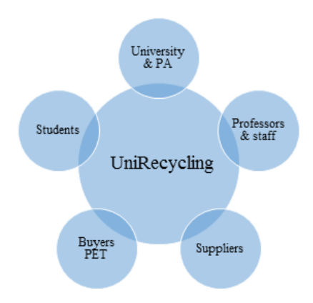
Figure 5. Stakeholder mapping

The partnership involves the participation of: