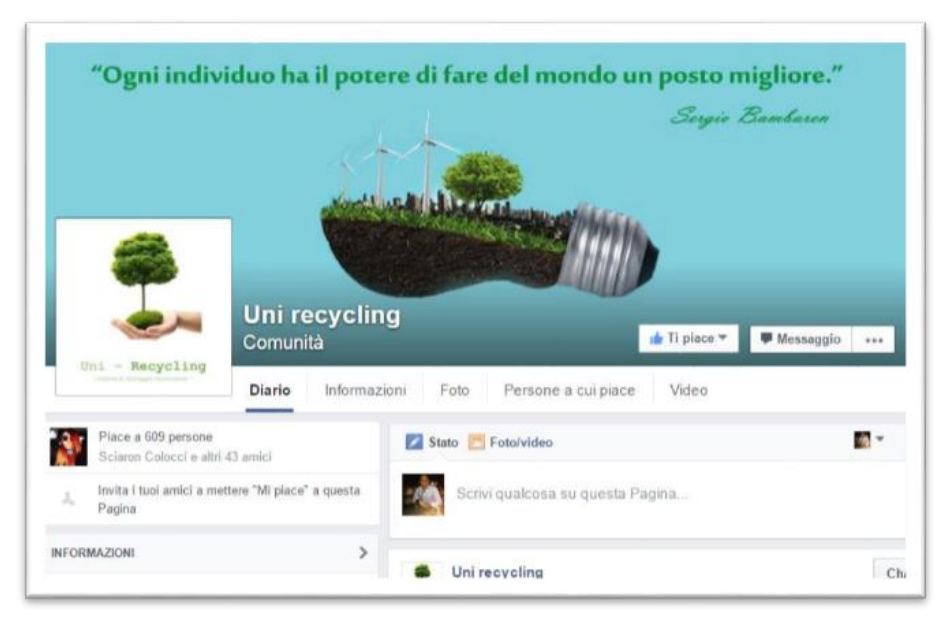
Figure 6. Facebook page of the UniRecycling (http://www.facebook.com/)