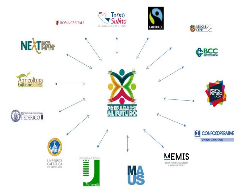
Figure 4. "Prize Preparing for the Future" network

piano music thanks to the contribution of the "Scuola Viva Musica" and "Mancini Pianoforti", who donated the piano to the Research Group in "Government and Civil Society", and furthermore the event was open to entire academic society from the School of Economics and beyond. During the event, the participants were asked to answer to a survey looking to assess the perceptions of the university role in the context. The survey's data are currently under analysis, and just a few preliminary trends can be set at this stage. It can be considered that, due to the increasing engagement of the students in these several events and opportunities, aiming to growing dialogue with different actors in the territory (business, nonprofit and so on) there has been seen an improvement of perception on the role played of the University, bridging the shift from a closed to an increasingly open and innovative system.