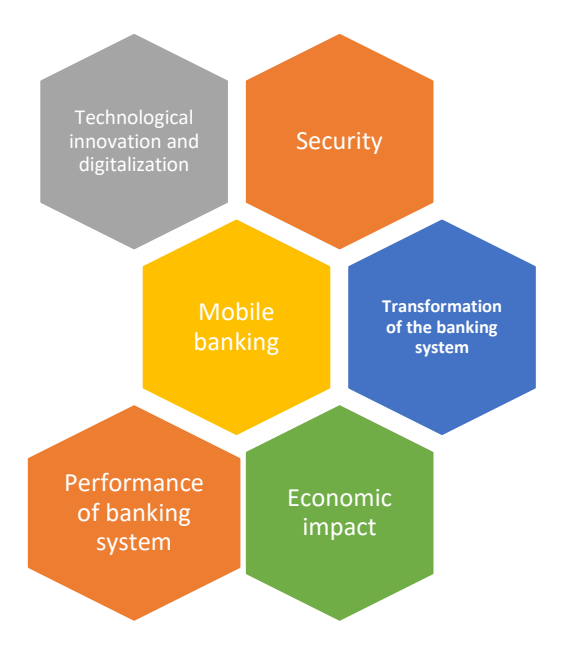
Figure 4. The impact of the pandemic in the banking sector

The COVID-19 pandemic is changing many things in the banking system: the way they work, new operations, and proceedings. The essential nature of the banking services required them not to close all their branches and to ensure people's access to financial resources. Around a quarter of bank branches have closed during the outbreak in many countries and territories because of the safety of employees, staff shortages, and less commerce occurring in general. Of the remaining 75 percent, many are open on reduced hours and with reduced staff (KPMG, 2020b). With all these challenges around them, they need to pay attention to the strategy that defines their future. According to PWC (2020b), they need to focus business continuity planning on issues for survival: adjust branch hours and staffing mix and times, switch in-branch visits to appointment-only, close some branches temporarily. All these changes implemented in the way they work will definitely influence how the banking system will look in the future.